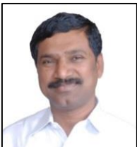
Sri (Dr.) Thatikonda Rajaiah Deputy Chief Minister Telangana State