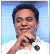
Sri K.T. Rama Rao Cabinet Minister for Panchayat Raj & IT, Telangana State